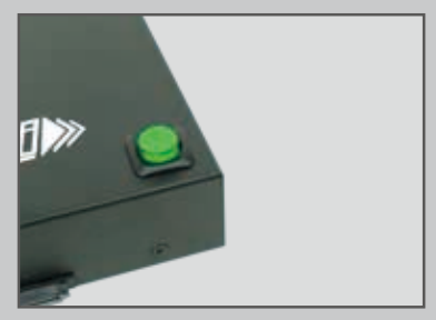
3. Press down the green button, the HD Mini will start duplication automatically and the LED(s) will keep flashing.