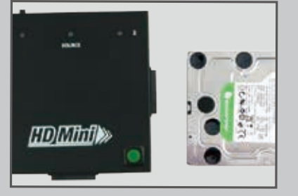
2.Plug in the source HDD and target HDD(s). The correspondentLED will be on if the HDD is connected well.