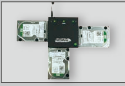
4 .After copy is done, the green light will stop flashing and stay on with a warning sound to tell the finish of duplication. If there is error during the duplication, the green light will go off with two warning sound as signal.

*The HD Mini can quickly identify the data area of source disk, and only copy the data area to save overall copy time (if the file system formats are not supported by the duplicator, it will copy the whole disk bit by bit).