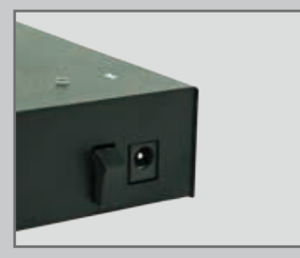
1. Plug in the power adapter (the other side of the power adapter should be plugged into a power outlet) and turn on the power switch.